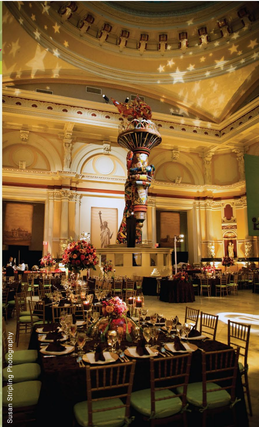
Susan Stripling Photography